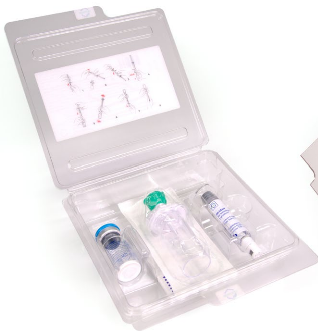
All-inclusive portable kit