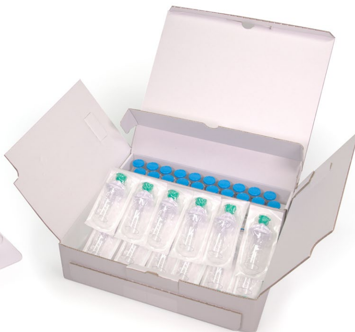
20 vials & 20 spike pack